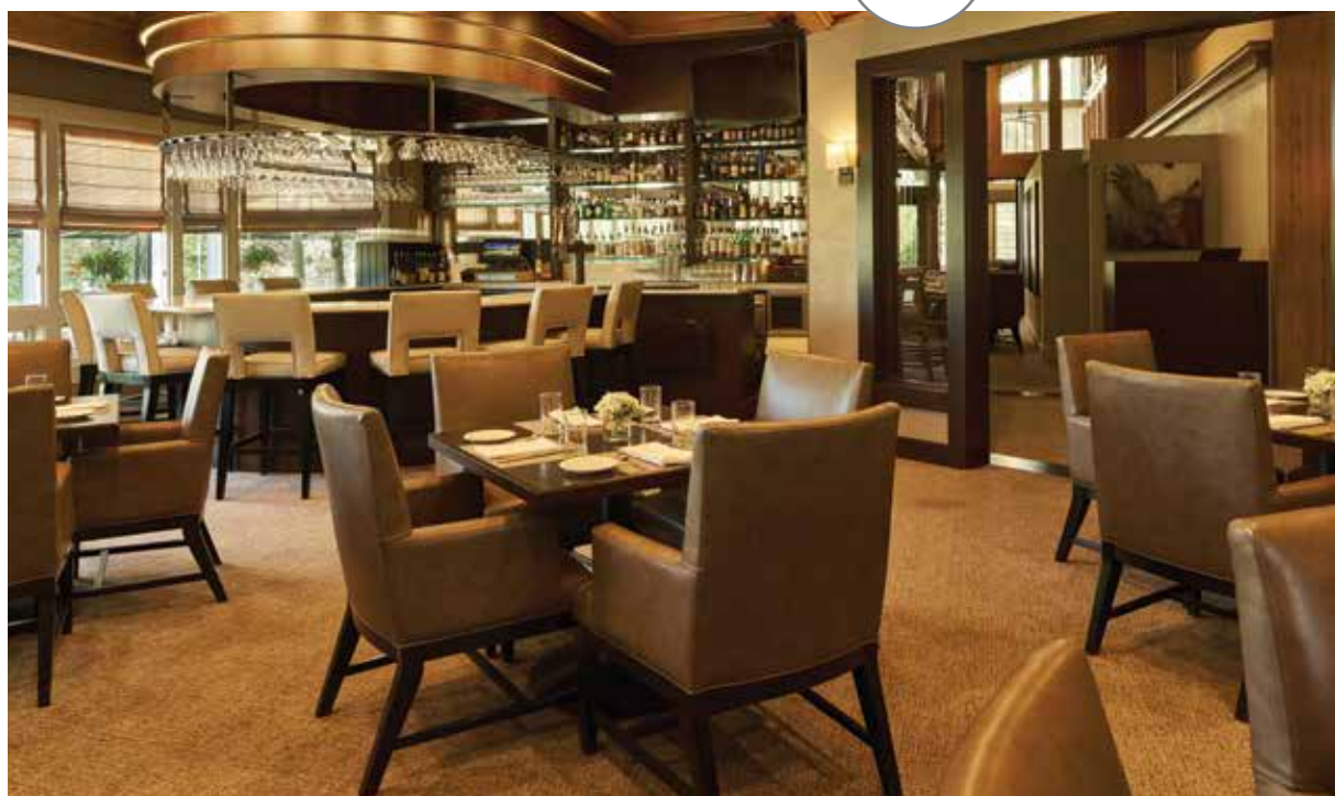
RIGHT: The tired, dated bar was redefined by applying a walnut veneer and a sleek quartz countertop. LED lighting was inset in the three-tiered cabinetry above the bar, creating an emphasis on the room's focal point.